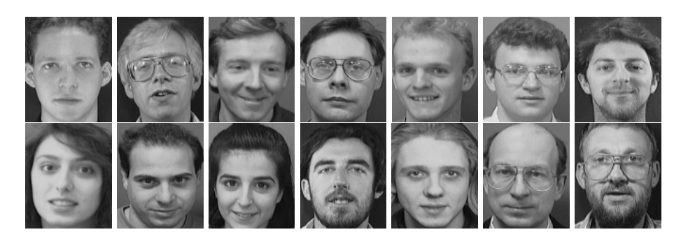
Fig. 2. Samples face images from the AT&T database of faces.