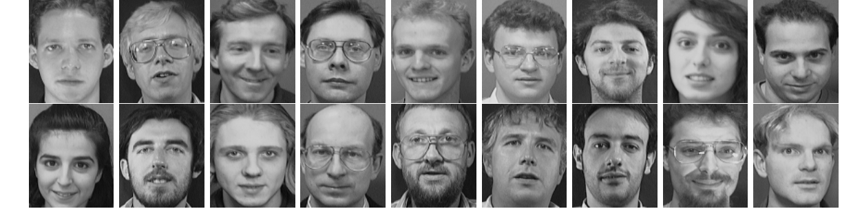
Figure 2: Samples face images from the AT&T database of faces.

All the images were taken against a dark homogeneous background with the subjects in an upright, frontal position (with tolerance for some side movement). The complete database contains 400 grayscale face images of size 92 \times 112 pixels.